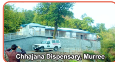
Chhajana Dispensary, Murree