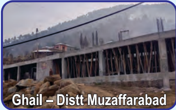
Ghail – Distt Muzaffarabad