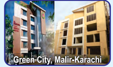
Green City, Malir-Karachi